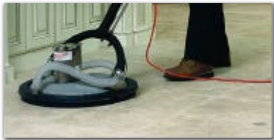
Tile and Grout

The PRODIGY HSR from Power Plus is the most powerful and versatile truck-mounted machine ever made.